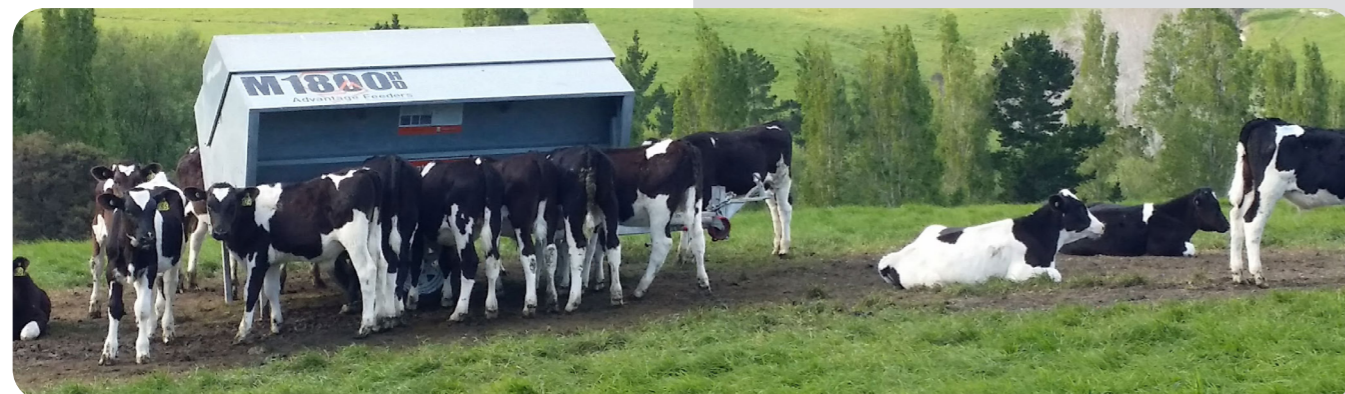
Measurements are length x width x height (mm)