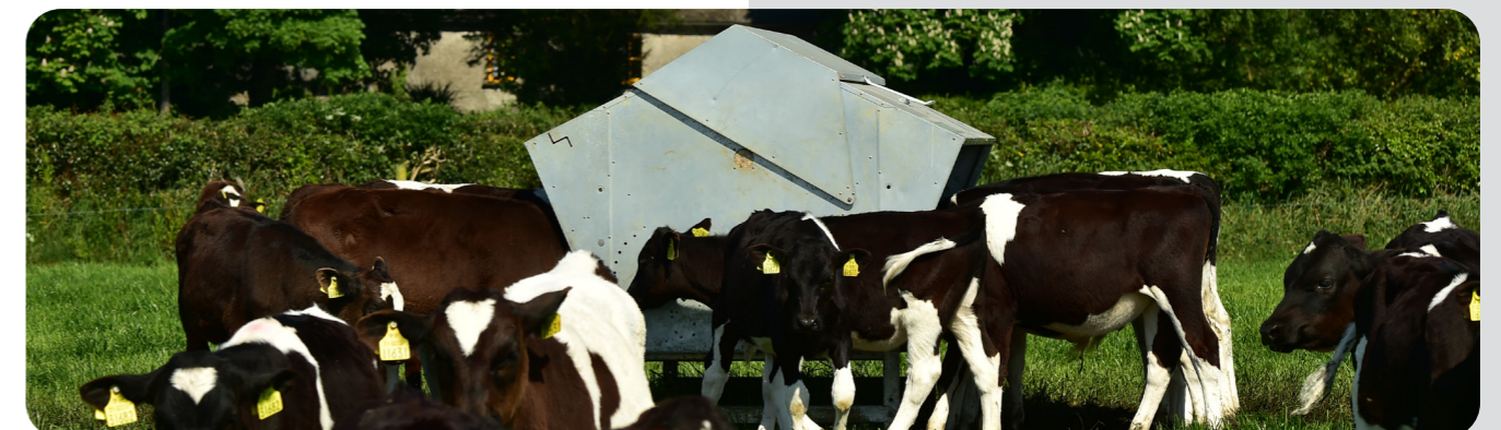
Measurements are length x width x height (mm)

Note: Brackets come standard with the 150HD to hang the unit on gates, fences or steel posts.